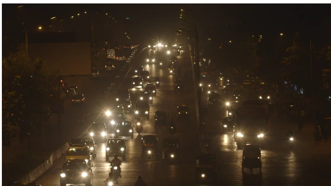
Heavy traffic at night

During the daytime there is lot of pollution due to the vehicular emissions. In the night the traffic is reduced and hence the city should be able to breathe well. However, due to the truck traffic in the night, the level of pollution doesn't come down at all. So people living in Delhi breathe polluted air throughout the day and night, non-stop, every day and night in the year.