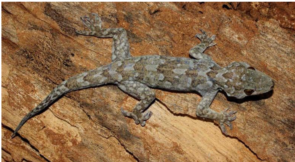
Rock-dwelling lizard a record image.

The new species has been named Hemidactylus yajurvedi (Kanker Rock Gecko). The large-sized lizard having a snout-vent length (SVL) of up to 98mm is the 27th Hemidactylus species known in India.