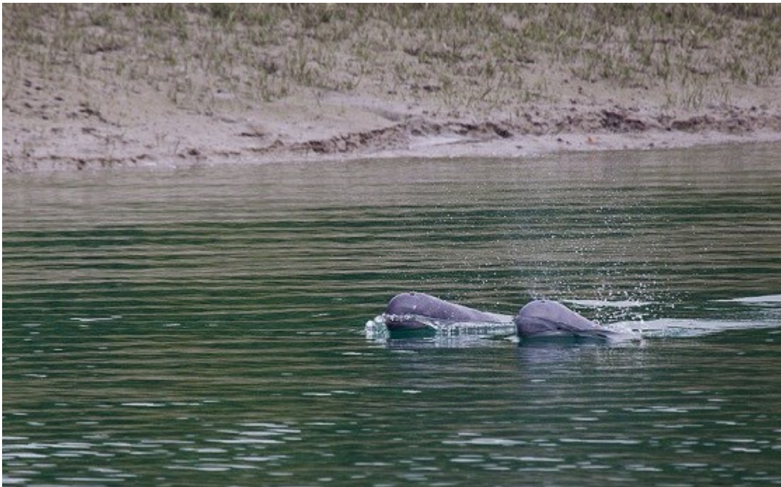
Irravady Dolphins in Sunderbans

The number of dolphin is estimated to be less than 2,000 in the country.