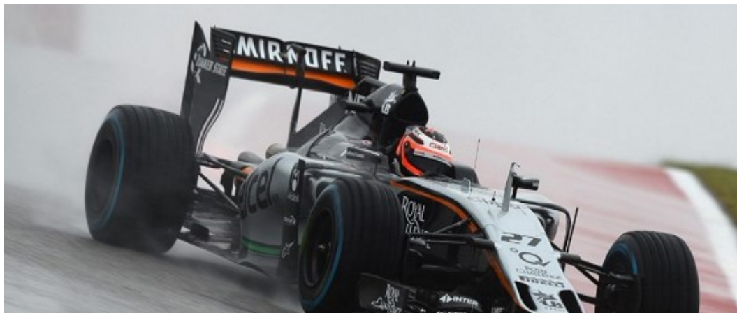
F1 cars emit high noise

Apart the human induced noise ie Anthropophony, noise is generated due to Geophony which is non biological sounds due