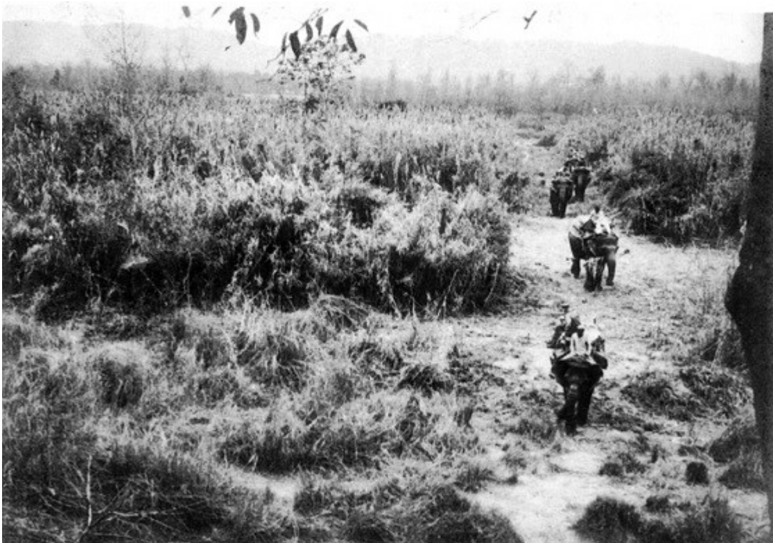
Corbett February 1973

In the afternoon we used to hire a trained elephant and roamed at our will.